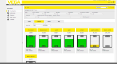
VEGA Inventory System - VEGA Hosting