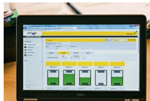
Inventory management with VEGA Inventory System.