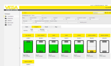
VEGA Inventory System - VEGA Hosting