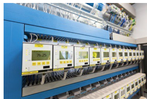
Control cabinet with VEGAMET 624 controllers for the underground solvent storage facility.

Thanks to VEGA Inventory System , those responsible for logistics and technology in the company become essentially system administrators: They can easily integrate additional locations into the system and also grant access rights to Brenntag customers. Level data recording over a longer period of time allows an assessment of business development up to the present and thus a forecast for the future. The automated flow of information with its digital transparency offers long-term advantages for the entire supply chain: early information for the supplier and security of supply for the customer.