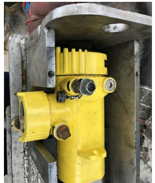
MiniTrac 32 is particularly suitable for applications with extreme vibration

MiniTrac 32 is particularly suitable for applications with extreme vibration.