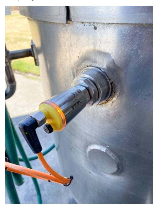
Thanks to its compact size, VEGAPOINT 21 can be mounted not only in tanks and vessels but also, for example, in narrow pipelines.

A new sensor from VEGA for capacitive point level measurement sounded promising, but it wasn't yet officially on the market. Nevertheless, the fruit juice company offered to be a tester of the sensor even before the official product launch. The new VEGAPOINT 21 is a level switch with adjustable switching point for detection of water-based liquids. The sensor and the tank form the two electrodes of a capacitor. Any change in capacitance due to a level change is converted into a switching signal.