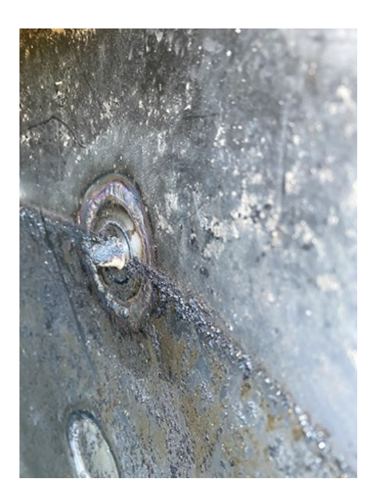
The VEGAPOINT 21 level switch is largely independent of medium properties and therefore

Conclusion: A special highlight – in the truest sense of the word – is the colourful, all-round switching status display of VEGAPOINT that allows quick and easy recognition of the switching status. With it the user can keep an eye on the status of the tank at all times. Workers at the fruit juice company also appreciate this feature, as it allows them to concentrate on their other tasks in juice production and not have to worry about something going wrong inside the tank.