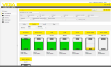
VEGA Inventory System - VEGA Hosting