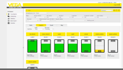
VEGA Inventory System - VEGA Hosting