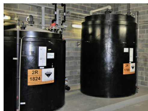
Chemical tanks for storing acids and alkalis.

The British town of Belvedere, near London, is the site of such a waste incineration plant. Four polypropylene tanks filled with sodium hydroxide are located on site. Every process medium is stored in large containers for long-term supply and in small day tanks for process-critical dosing and neutralization. All tanks were originally supplied with a low-cost bubbler level measuring system, which eventually failed due to corrosion and buildup. Vapours and gases escaped through the housing. Moreover, the systems were unreliable, inaccurate and very unsafe.