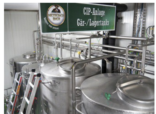
Additional pressure transmitters are used in the CIP tank.

It's been more than 20 years since the company first became aware of VEGA. That was when a level measuring system was installed on a spent grain silo. Over the years, step by step, new measuring points have been added. More than anything else, the demand for increasing hygienic process requirements were the catalyst for the upgrading and extension of measuring equipment in the brewery. All the fermentation and storage tanks were rebuilt, one after the other, to enable them to be cleaned better. Today, VEGA sensors are used in many places across the plant, e.g. in the CIP systems, in the brewing water tanks, in the storage tanks as well as in the fermentation tanks in the brewhouse. The sensors serve as overflow protection, support precise inventory measurement and take over the dosing of mixed beverages as well as the entire process control. Vogt especially appreciates their close proximity to the VEGA factory.