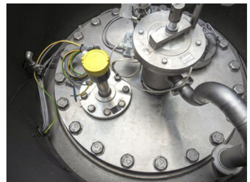
A VEGAPULS 64 radar level transmitter performs contents measurement.

During the last plant modification, a new buffer tank for mineral water was installed. Here too, a VEGAPULS 64 took over the task of inventory control. Since the water used for brewing is largely responsible for the quality and taste of the beer, the Hornberg brewers have always given it special attention. Many years ago they discovered a new spring in a buried tunnel in the forest above Hornberg. This particularly soft water turned out to be of such high quality that it is now marketed all over Germany as a brand of its own, called "Hornberger Lebensquell" ("Life Source"). In the meantime this spring water has become a second sales mainstay for the family brewery.