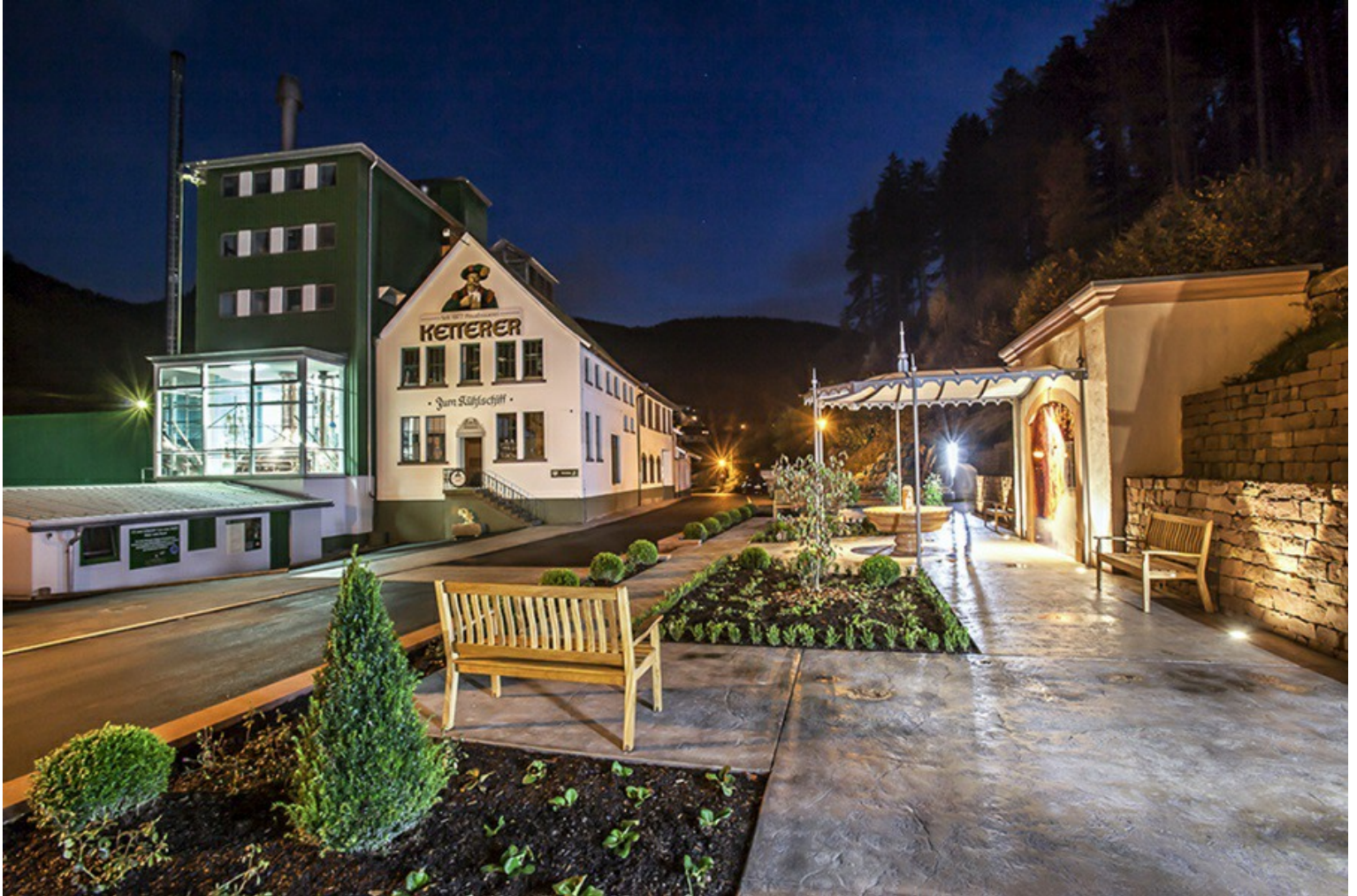
Front façade of the Ketterer brewery in Hornberg.