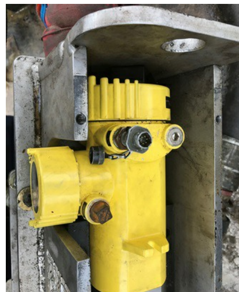
MiniTrac 32 is particularly suitable for applications with extreme vibration

MiniTrac 32 is particularly suitable for applications with extreme vibration.