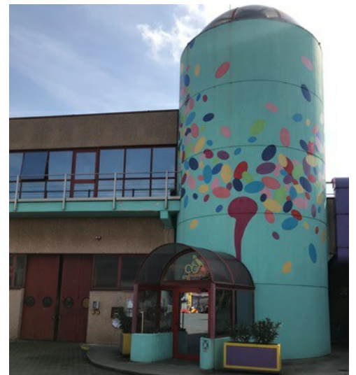
Headquarters of ACS Dobfar in Tribiano near Milan.

The manufacturing processes are extremely complex. For that reason, numerous sensors are required to monitor production. In the storage tanks and reactors, it is mainly parameters such as level and pressure that are of interest. The company became aware of VEGA through the positive feedback coming in from the market. Today more than ever, people are convinced of the high quality of VEGA process instrumentation. For its new production facilities, ACS Dobfar chose to use sensors from VEGA and is gradually replacing older instruments with them. “We’re using mainly VEGAPULS non-contact radar and VEGAFLEX guide wave radar level sensors on our raw material and waste water tanks. And since the market launch of VEGAPULS 64 non-contact radar in 2016, we’ve been using it more and more in our reactors,” explains Lino Brucoli, – the person responsible for plant automation at ACS Dobfar – pointing out the main areas of application for radar level sensors.