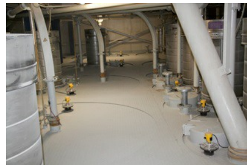
Every silo now has a VEGAPULS 69 that replaced the existing silo weighing system.

Almost all the sensors worked reliably right from the start and delivered accurate readings. Since VEGA instruments indicate filling percentages, a program converts these values into tonnages. The inventory management system administers these results and provides additional data security. The only silo that gave the technicians some headaches was the one holding raw materials with extremely low bulk density. Such materials are very difficult to measure and up to that point no sensor had worked reliably. One of the problems, for example, are the welding seams of silos, which generate false echoes. Even the echo curves of empty silos are extremely complex. "Together with VEGA we positioned the sensor differently and changed its orientation. We also adjusted the parameters again. Since then, this measuring point works perfectly."