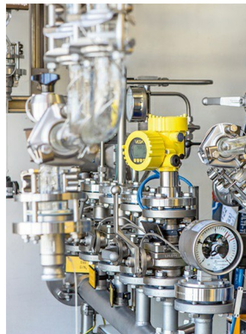
Ensuring simplified qualification: CARBOGEN AMCIS AG uses mostly identical, standardized pressure transmitters.