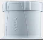
VEGAPULS Air 42