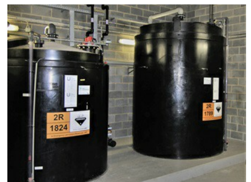
Chemical tanks for storing acids and alkalis.

The British town of Belvedere, near London, is the site of such a waste incineration plant. Four polypropylene tanks filled with sodium hydroxide are located on site. Every process medium is stored in large containers for long-term supply and in small day tanks for process-critical dosing and neutralization. All tanks were originally supplied with a low-cost bubbler level measuring system, which eventually failed due to corrosion and buildup. Vapours and gases escaped through the housing. Moreover, the systems were unreliable, inaccurate and very unsafe.