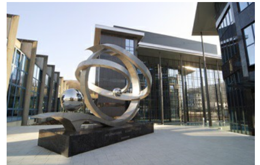
Headquarters of CARBOGEN AMCIS AG in Bubendorf, Switzerland.

The demand for personalized medicines and seamlessly quality validation is increasing. Drivers of the needed innovations are often the smaller, research-oriented companies that make their processes and approval procedures flexible and reduce both effort and costs through standardization. A good example of this can be found at CARBOGEN AMCIS AG, where VEGABAR Series 80 is used for pressure measurement. Thanks to their wide measuring range and ceramic CERTEC® measuring cell, these high-performance pressure transmitters meet the requirements of bioprocesses, from fermentation and filtration to purification.