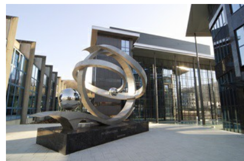
Headquarters of CARBOGEN AMCIS AG in Bubendorf, Switzerland.

The demand for personalized medicines and seamlessly quality validation is increasing. Drivers of the needed innovations are often the smaller, research-oriented companies that make their processes and approval procedures flexible and reduce both effort and costs through standardization. A good example of this can be found at CARBOGEN AMCIS AG, where VEGABAR Series 80 is used for pressure measurement. Thanks to their wide measuring range and ceramic CERTEC® measuring cell, these high-performance pressure transmitters meet the requirements of bioprocesses, from fermentation and filtration to purification.