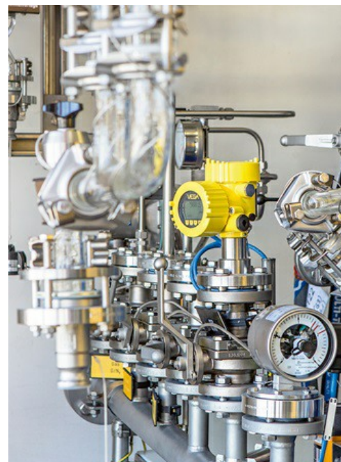
Ensuring simplified qualification: CARBOGEN AMCIS AG uses mostly identical, standardized pressure transmitters.