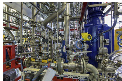
Concentration changes of the reacting solutions take place in milliseconds in many pharmaceutical processes.

All VEGABAR 82 pressure transmitters in use at CARBOGEN AMCIS AG are equipped with a ceramic CERTEC® measuring cell. With these cells, pharmaceutical customers can now be absolutely certain that even rapid temperature changes will not affect the pressure measurement. The ceramic diaphragm was coated with a highly durable gold film on its inside face, making it extremely sensitive and able to register temperature changes with an accuracy of \pm 2 K at lightning speed.